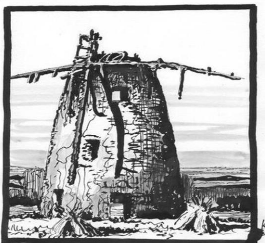
M358 STUTTONS Yorks